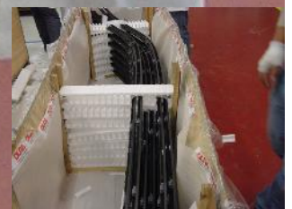
Nefab ExPak box designed